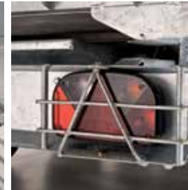
Rear Light Guards