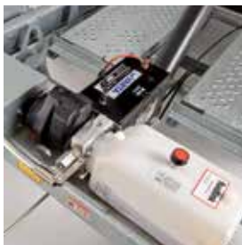
Electric Hydraulic Tip