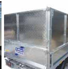
Solid Side Extensions