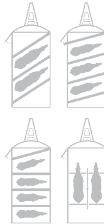
Typical partition layouts of HB510XL